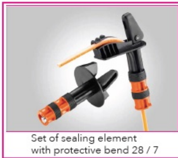
Set of sealing element with protective bend 28 / 7