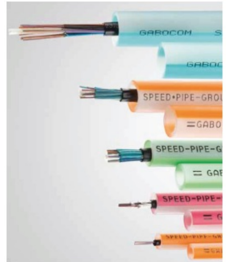
The speed-pipe® ground are directly buried and assure highest flexibility when constructing fibre optic networks.