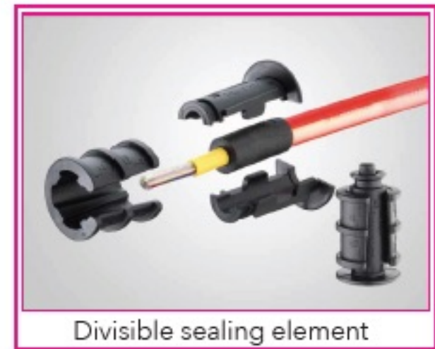
Divisible sealing element