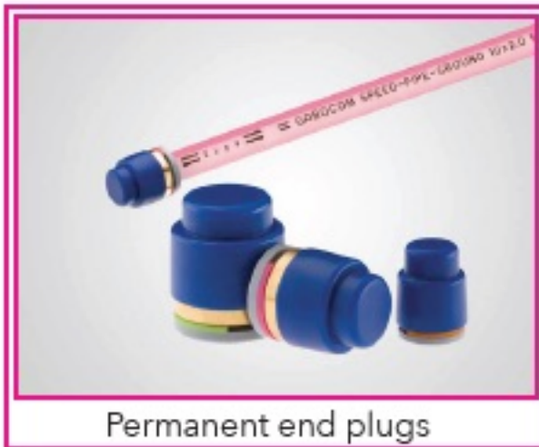
Permanent end plugs