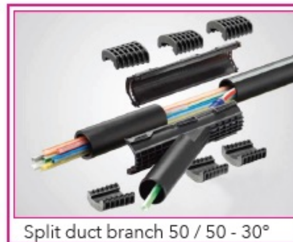
Split duct branch 50 / 50 - 30°