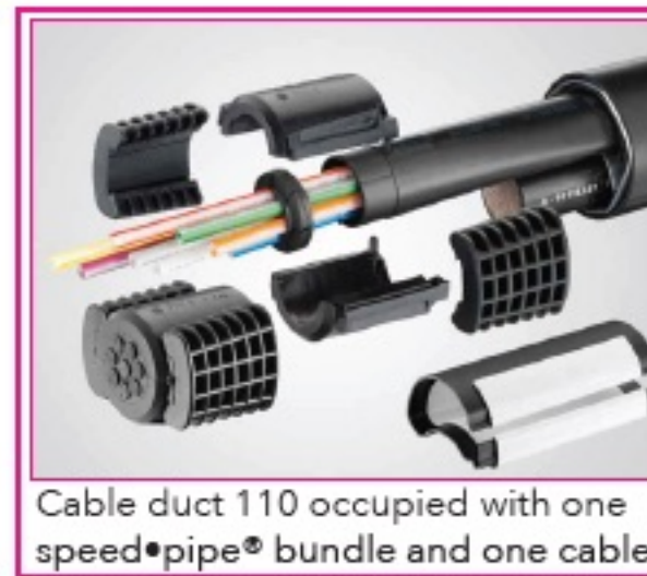
Cable duct 110 occupied with one speed•pipe® bundle and one cable