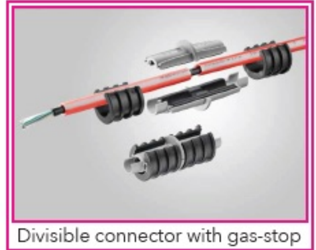
Divisible connector with gas-stop