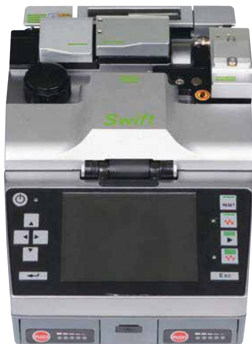
"Swift F1" Fusion Splicer