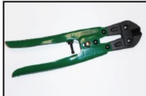
Long flat nose plier