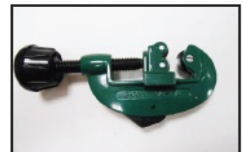
Cable stripper vertical