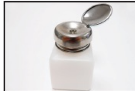
Alcohol bottle (empty)