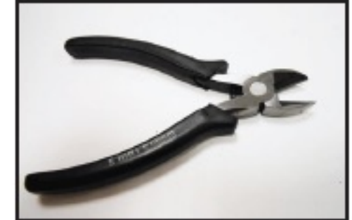
Cable braking plier