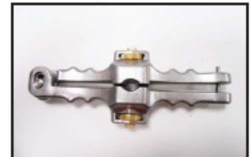
Cable stripper horizontal