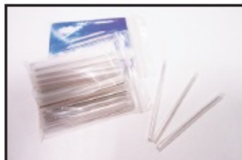
Splice protector sleeves