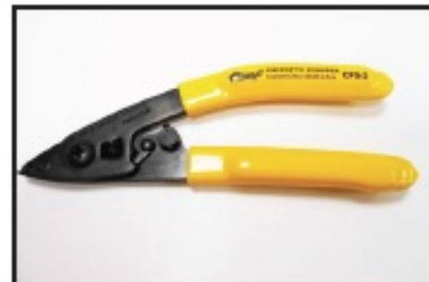
Fiber Optical Stripper