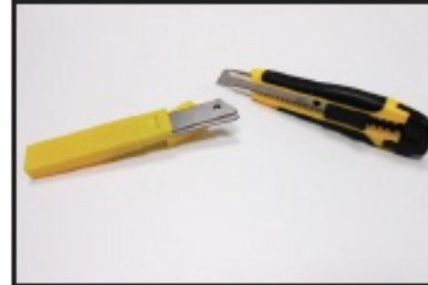
Knife and blade of knife