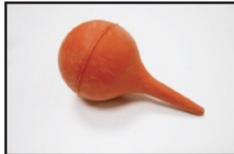
Rubber suction bulb